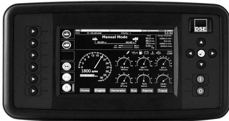
Example of DSE8721 colour display

DIMENSIONS 240.0mm x 181.1mm x 41.7mm (9.4” x 7.1” x 1.6”)