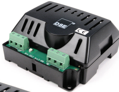
DSE9150 - 3 A 12 V